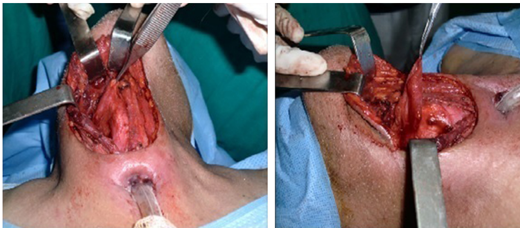
Fig. 2. Intraoperative view: laryngocele dissected as far as its pedicle.

eliminates any predisposing factors, particularly laryngeal cancer, a classical and real association with the laryngocele [1].